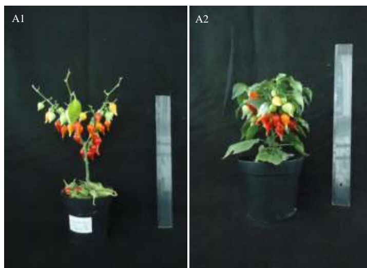
Figure 1 – Effect of ethylene action on cultivar ‘Biquinho Vermelha’, 48 hours after exposure to ethylene. A1 – Control plant (0 mg L -1 PBZ); A2 - 5 mg L -1 PBZ.