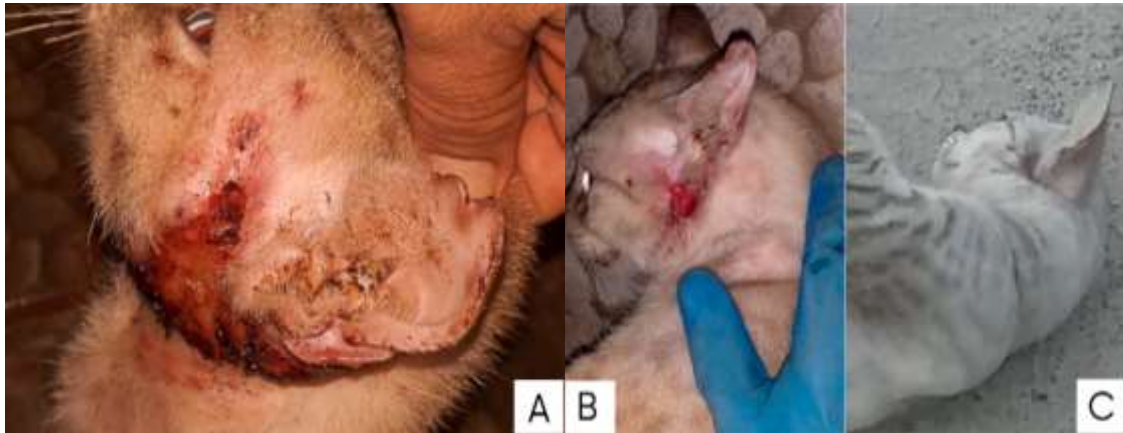
Figure 3. (A) Remission of the lesions after one month of treatment. (B) Evolution of the treatment response after 4 months. (C) Animal after treatment, with complete remission of the lesions and weight gain.