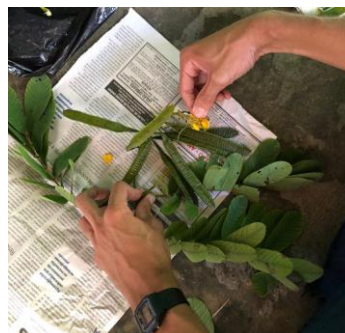
Figure 2. Botanical collection of S. reticulata .

For this research botanical collections (Figure 2) and the identification of the species S. reticulata were realized according to traditional techniques in plant taxonomy (Martins-da-Silva et al., 2014), on 18 September 2019, in the Research Campus of Museu Paraense Emílio Goeldi, in the city Belém from the Pará state, Amazonia, Brazil, the geographic coordinates of 01°27'04" (S) and 48°26'47" (W). A sample was selected for registration and identified and incorporated as an exsicate in the in the Herbarium of the Museu Paraense Emílio Goeldi (MG) under the registration MG 233276.