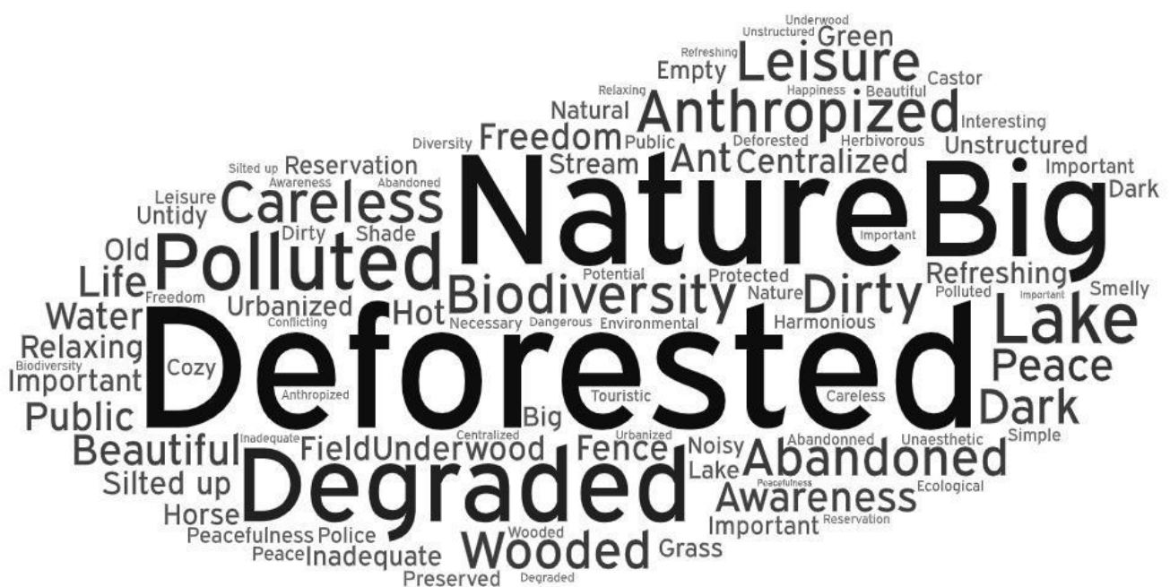
Figure 2. Word cloud about the inducing expression “Arnulpho Fioravante Park is...”

The Free Word Association Test resulting from the inducing expression “Arnulpho Fioravante Park is...” produced a dictionary with 93 words, many of which were considered synonymous and semantically close. After being grouped and reduced, they generated a dictionary of 42 words shown in Figure 2.