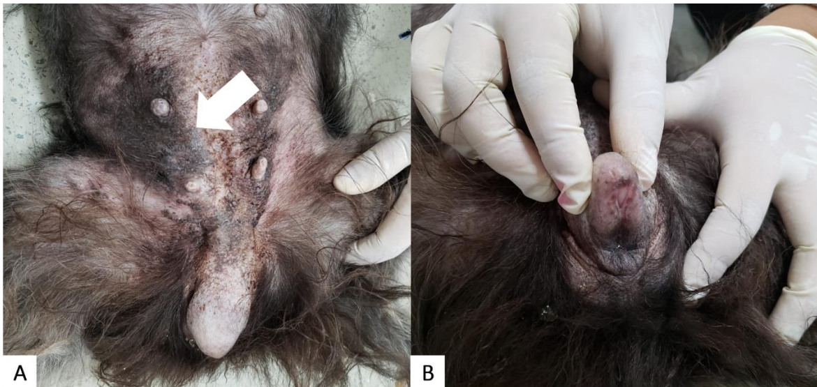
Figure 1. Inflammatory mammary carcinoma affecting the caudal mammary glands in a female dog. Note the lesion in M4 and M5 right (arrow) (A) and the vulvar edema (B).

The superficial inguinal lymph nodes were enlarged by palpation. The patient's heart rate, respiratory rate, and rectal temperature measured within normal limits. The patient's food and water intake were reportedly normal.