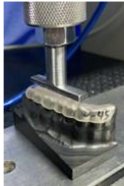
Figure 5 - Compressive test of occlusal splint over steel model.

2016), applying 200 N at 0.5mm/min, as per the protocol in De Carvalho et al. (2017).