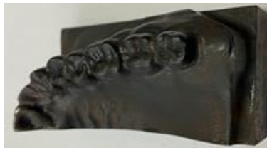
Figure 1 - Steel model.

For the production of the test specimens, a dental manikin (DENT-ART Materiais Didáticos Odontológicos Ltda. São Paulo-SP, Brazil) was scanned on a bench scanner Ceramill MAP 400+ (Amann Girrbach Brasil LTDA, Curitiba-PR, Brazil) to generate an STL file. The file was used as the basis to produce a 2D model in steel (Figure 1), which was then machined on a DCM 620-5F (Indústrias ROMI S.A. Santa Bárbara do Oeste-SP, Brazil). The model was tempered with 46 HRC and scanned with the bench scanner Ceramill MAP 400+ (Amann Girrbach Brasil LTDA, Curitiba-PR, Brazil) to serve as the model for the design and manufacture of the occlusal splints and as a basis for the compressive test of the test specimens.