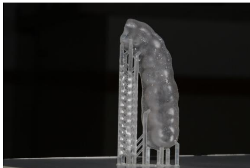
Figure 4 - Plate manufactured at 90 degrees.