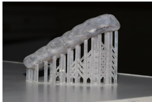
Figure 3 - Plate manufactured at 45 degrees.