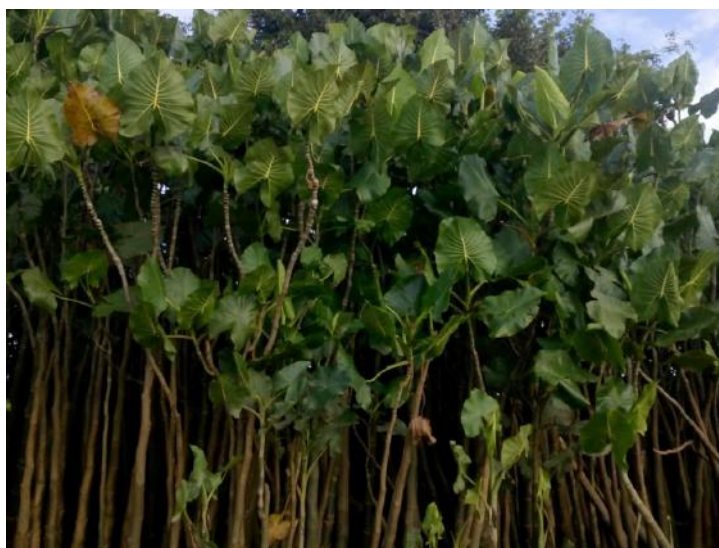
Figure 1. Image of the species Montrichardia linifera , collected in Morros da Mariana, Ilha Grande (Piauí, Brazil). The species is an aquatic macrophyte, with several applications in popular medicine.

The specimens of M. linifera were collected during the rainy season, between March and May 2013, in four locals: Galego (2°46'49''S; 41°51'51''W), Porto dos Tatus (2°50'17''S; 41°49'52''W) and Morros da Mariana (2°51'15,9''S; 41°48'49,1''W), located at Ilha Grande (Piauí, Brazil), and Lagoa do Bebedouro (2°46'49''S; 41°51'51''W), in Parnaíba (Piauí, Brazil). An exsiccate was deposited at Parnaíba Delta Herbarium (HDELTA), from the Universidade Federal do Delta do Parnaíba (UFDPAr), under the following protocol number: 3541. The access activity to the Genetic Heritage/CTA was duly registered in SisGen, with the registration number A3D47B . The species is represented in Figure 1.