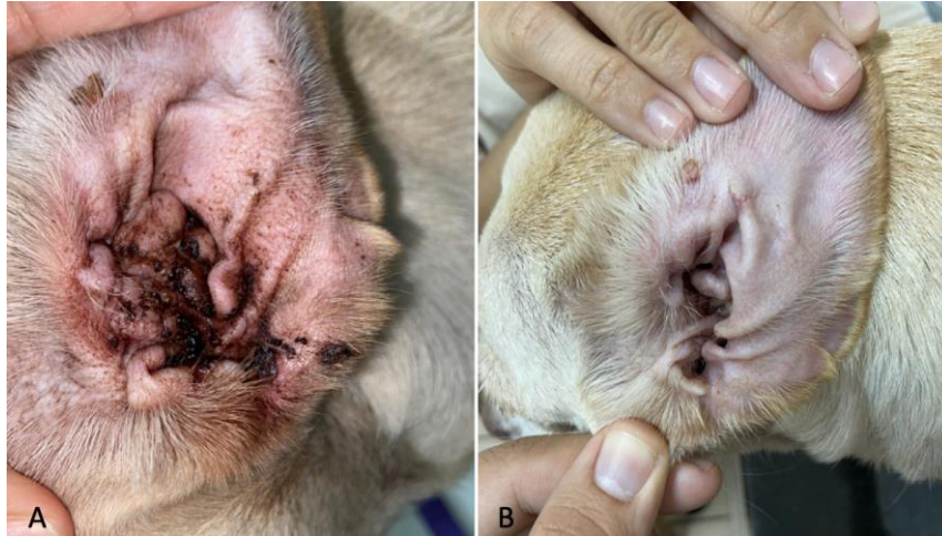
Figure 3. Clinical appearance of a canine ear with otitis externa secondary to canine atopic dermatitis. (A) An erythematous lesion is observed, with discrete hematic crusts, erythema and lichenification of the ear pinna. (B) Clinical appearance of the pinna after 30 days of infection and inflammatory control therapy.