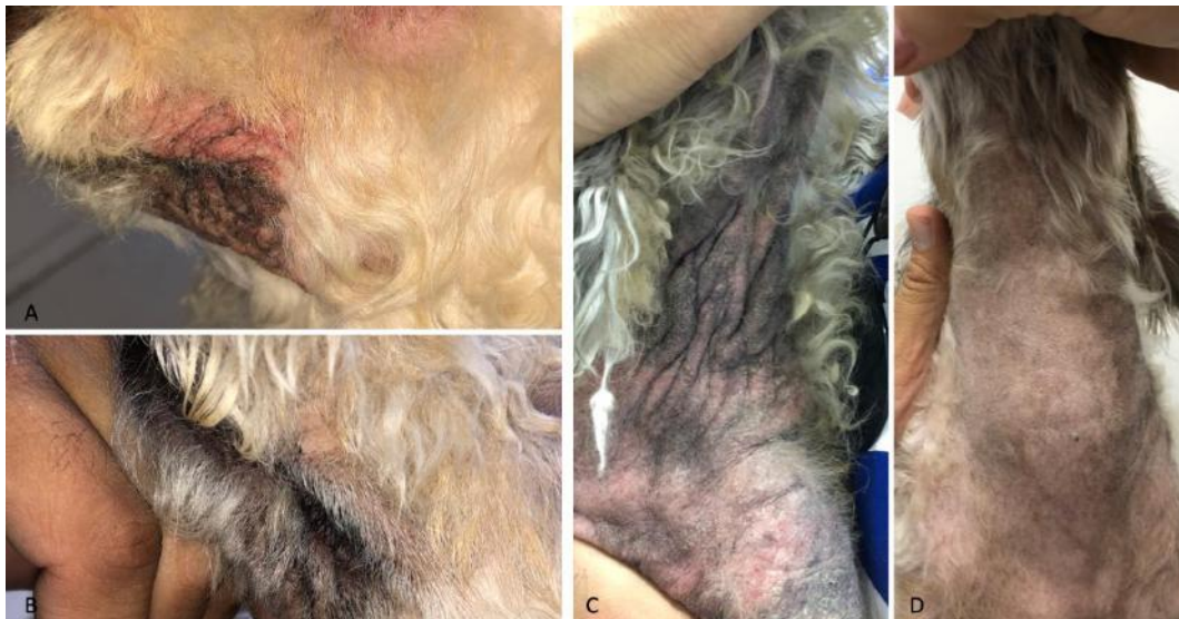
Figure 2. Clinical appearance of cutaneous lesions associated with cutaneous Malasseziosis. Erythema, hyperpigmentation and lichenification are observed in the perilabial (A) and cervicothoracic (C) regions. (B) and (D) Clinical aspect of the lesion after 30 days of therapy, with reduction of the inflammatory and scaling process, as well as the beginning of hair growth.