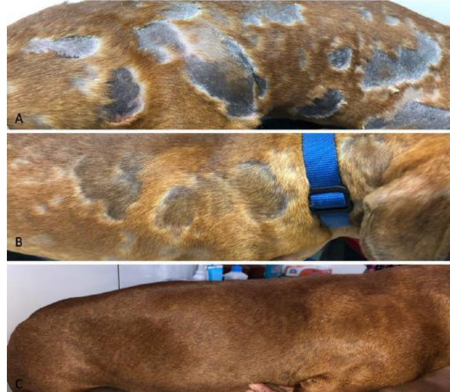
Figure 1. Superficial bacterial pyoderma lesion pattern before and after treatment. (A) Initial appearance of the lesion, with the presence of large alopecic areas and diffuse epidermal collar lesions throughout the body. (B) Lesion appearance 30 days after the start of therapy, with reduction of the inflammatory and scaling process, and beginning of repilation. (C) Lesion appearance after 60 days of therapy.