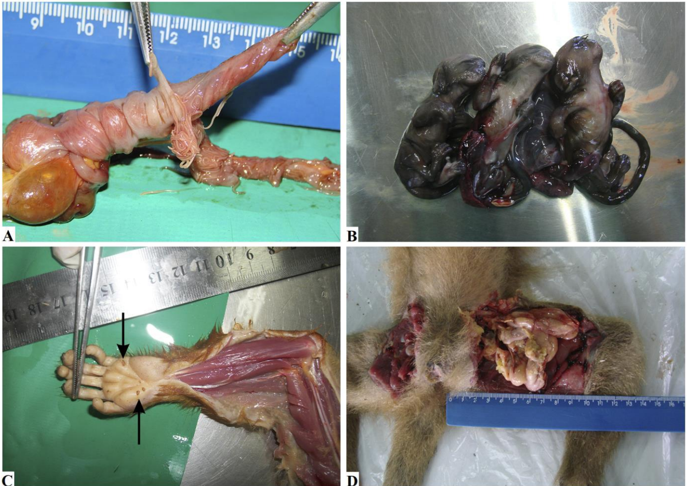
Figure 2. Different macroscopic conditions in neotropical primates. A) Intussusception in the cecum of free-living C. jacchus . Visualization of the intussusception and samples of Trypanoxyuris callithricis after longitudinal sectioning of the intestinal loop. B) Visualization of three well-formed C. jacchus fetuses that caused maternal death by dystocia. C) Electrocution injury in Saimiri sp. with isolated left-hand circular lesions compatible with Jellinek's marks (arrows). D) Acquired femoral hernia in Sapajus flavius . Intestinal loop protrusion of the small intestine portion through the femoral canal and loop segment rupture.