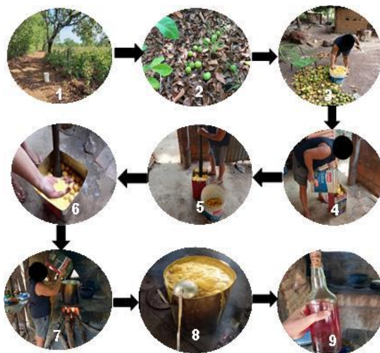
Figure 2. Flowchart of pequi oil extraction.