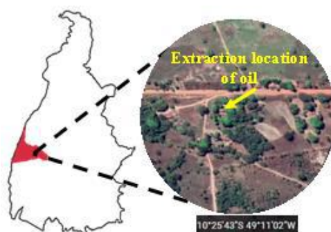
Figure 1. Location of fruit harvest and oil extraction.

The pequi fruits were harvested in the Piauzinho allotment in the municipality of Pium - TO (figure 1) in October 2021. After collection, 100 fruits without injuries were selected, presenting a certain sphericity. After selection, the fruits were transported in thermal boxes, with ice, for biometric analysis, 24 hours after selection, at the IFTO Fruit and Vegetable Processing Laboratory. The surplus of the selected fruits was transported in a trailer attached to motor vehicles to the Piauzinho allotment to extract the oil from the pulp of the fruits.