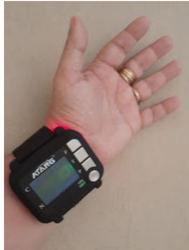
Figure 2 - Application of the ILIB technique ILIB via transcutaneous.