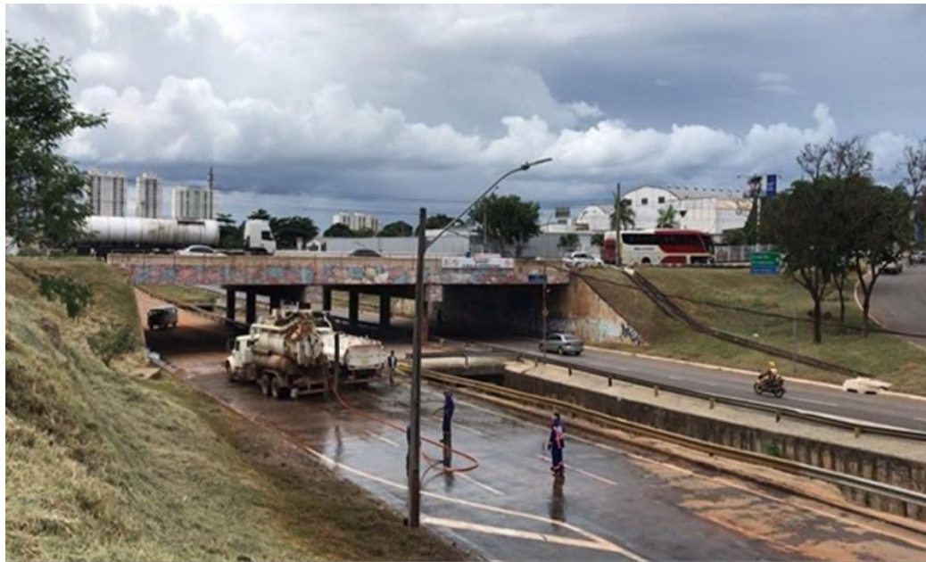
Figure 5 - Reopening of the Botafogo Marginal, February 2018 data.