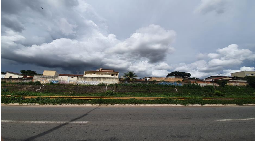
Figure 4 - Irregular houses Marginal Botafogo (St. Universitário), Goiânia.