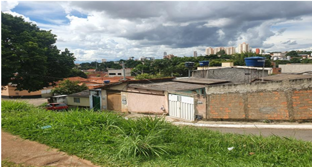
Figure 3 - Current view of Vila Lobó (Jardim Goiás), Goiânia.

The unbridled and irregular occupation, over the years, it is verified, even with its regularization through the administrative procedure and its titling after 5 years of land legitimation, the deficiencies of the irregular and unplanned occupation, reflects its lack of structure for the population, as seen in Figure 3, Vila Lobó, close to one of the prime regions of Goiânia, but without proper planning and regularity in its occupation for more than 30 years, reflects on the city as a whole, as a regular urban space. in accordance with the legislation, but visibly irregular, as it is occupied without organization and structure with smaller lots, without sidewalks, adequate postage, water, and sewage.