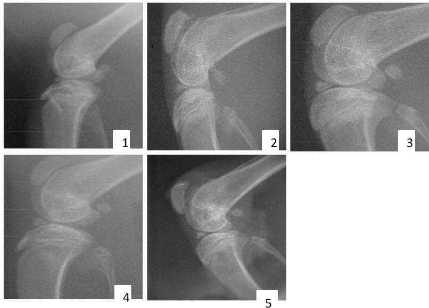
Figure 2 Periapical radiography of the knee joints of the animals in the experiment. Profile images of the radiographed parts. Fig. 1 control group (I G.) Fig 2 (IIG.) (ARI), with 21 days. Fig 3 (IIIG.) (ARI + Apitoxin) with 21 days. Fig 4 (IV G.) (ARI + US), animals with 21 days. Fig 5 (V G.) treated by phonoforesis (ARI US+) Apitoxin; animal with 21 days.