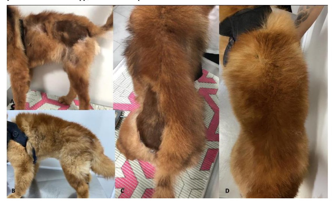
Figure 1. Non-inflammatory alopecia in a chow-chow dog (A1). (A) and (C) Lesion aspect with the presence of lateral alopecic areas that extend from the limb to the trunk without signs of inflammation at first consultation. (B) and (D) Skin aspect 60 days after the initial therapy, with evident repilation.

The evaluated dogs were confirmed with AX diagnosis based on clinical history and progression, lesion pattern and exclusion of additional non-inflammatory skin alopecic diseases. The cutaneous alterations are indicated in figures 1, 2 and 3. The dogs went through exclusion of clinical history/signs associated with hyperadrenocorticism and hypothyroidism. Futhermore, cutaneous parasitological exam was carried out to rule out demodectic and sarcoptic manges, and cytological exam was performed to observe the presence/absence of skin infections.