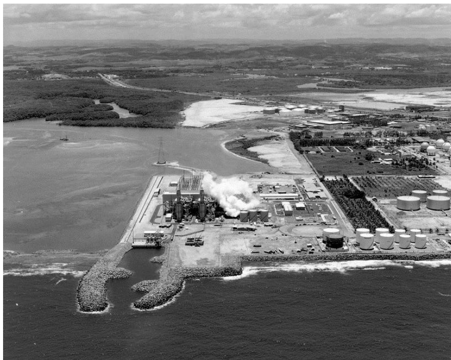
Figure 1. Image of the Pernambuco Thermoelectric Power Plant (TERMOPE).