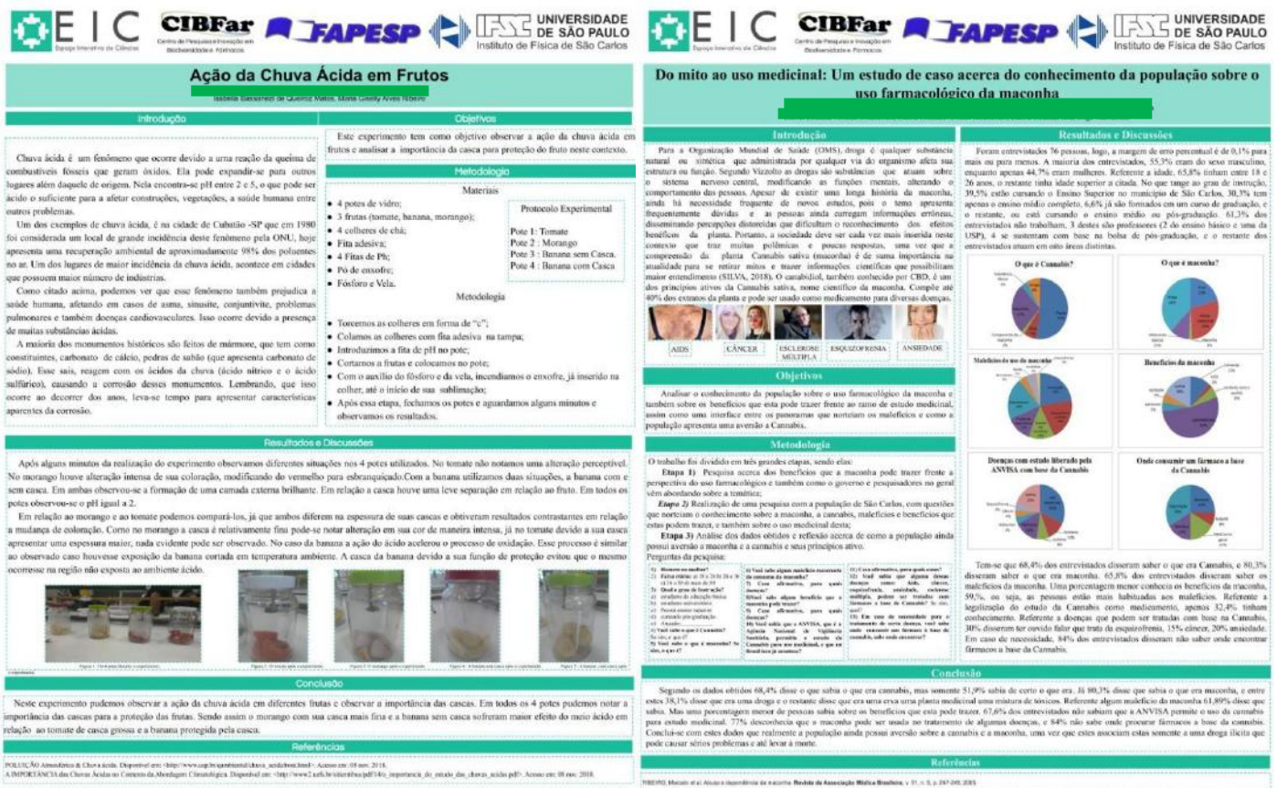
Figure 2. Work 3) presented at the 2018 Workshop and work 1) presented at the 2019 Workshop.