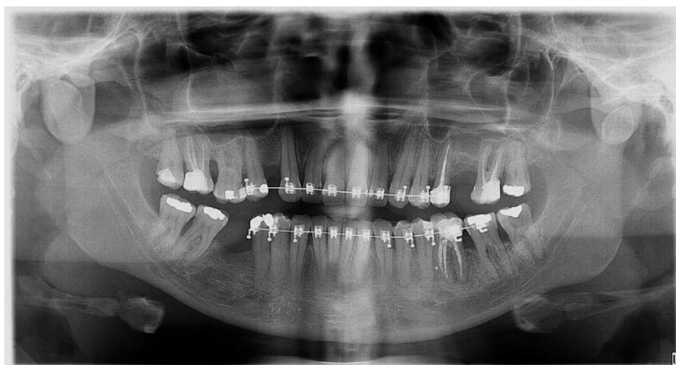
Figure 2 - Panoramic radiography.

As well as X-ray image with 70KV and 13 mA, pixel image 100 x 100 m and exposure time 16.4s (Fig.2).