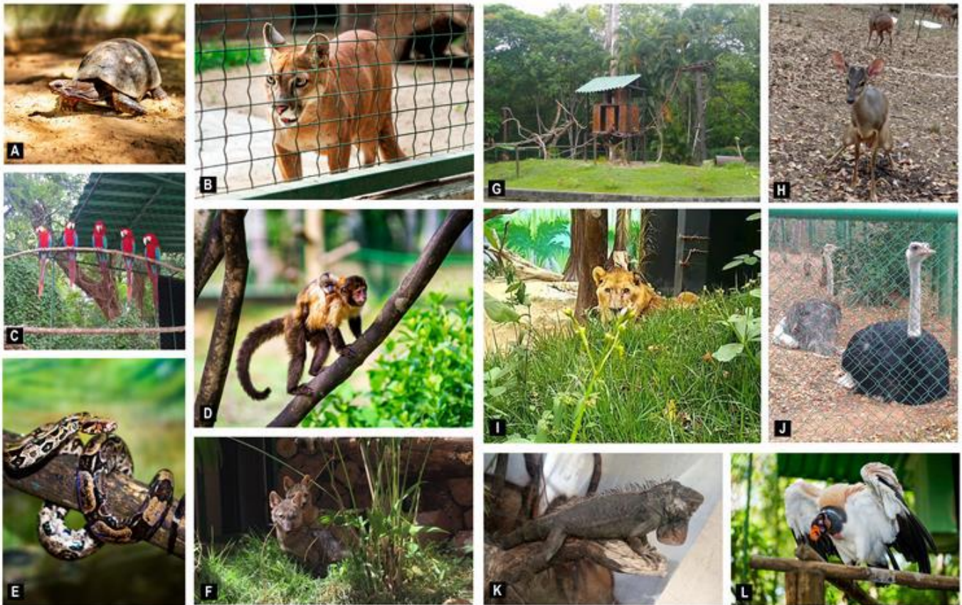
Figure 2: Aspect of some enclosures and animals of the Matinha Municipal Park, Itapetinga, Bahia sampled in the study: a) Tortoise; b) Cougar; c) Scarlet macaw; d) Black-striped capuchin; e) Red-tailed boa; f) Crab-eating fox; g) Enclosure for black-striped capuchin; h) Brown brocket; i) Lion; j) Ostrich; k) Argentine black and white tegu; l) King vulture.