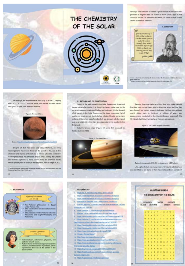
Figure 1 - Some pages from the guidebook.

The guidebook (Figure 1) was researched for and written in November and December 2021, respectively. Its layout, design, and illustrations were done on Microsoft Word. Images of the planets, satellites, and phenomena are from the websites and webpages cited in the figure captions. The guidebook included concise biographies of scientists of major importance to astronomy, namely, Galileo Galilei, Nicolaus Copernicus, Isaac Newton, Hypatia of Alexandria, and Johannes Kepler. Scientific curios — about scientific discoveries during the course of civilization — and a small puzzle were also interspersed throughout the text. The guidebook in Portuguese and English can be accessed at https://drive.google.com/file/d/1yeq7nCxZ7GowN5qIvQi_w0HSu2eqa20C/view?usp=sharing .