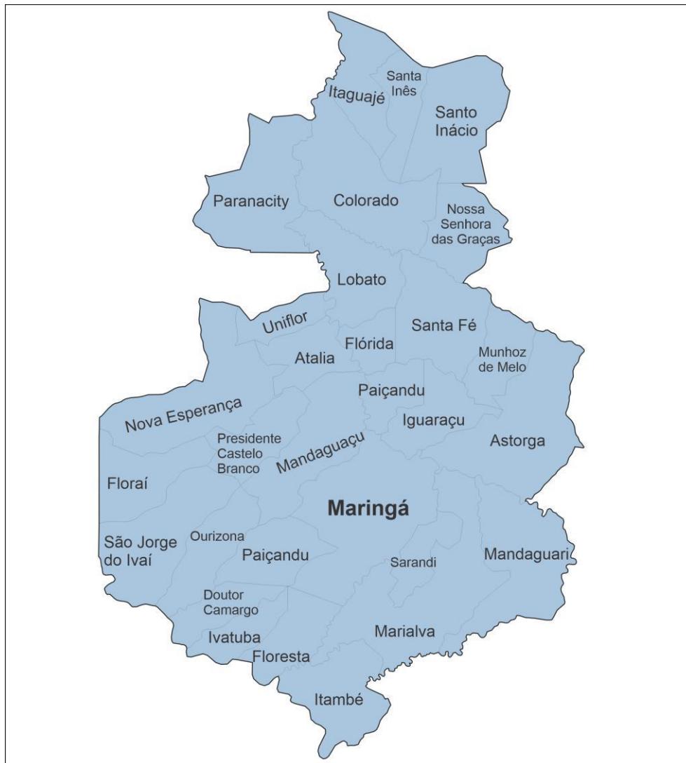
Figure 1. Geographic scope of the 15th Regional Health Authority of the state of Paraná, Brazil.

Municipalities belonging to 15th Regional Health Authority of the state of Paraná. We highlight the location of the city of Maringá, where the State University of Maringá is located.