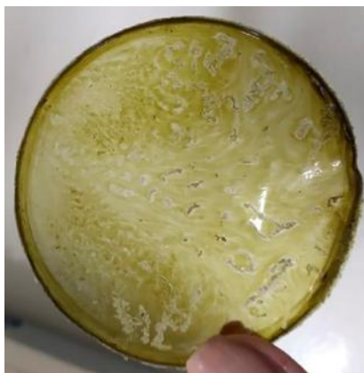
Figure 2 - Film incorporated with 15% extract.