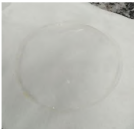
Figure 1 - Control film.