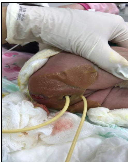
Figure 3 - Procedure for inserting the number 6 Foley's probe into the vaginal cavity.