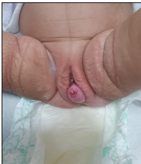
Figure 2 – Neonatal uterine prolapse.