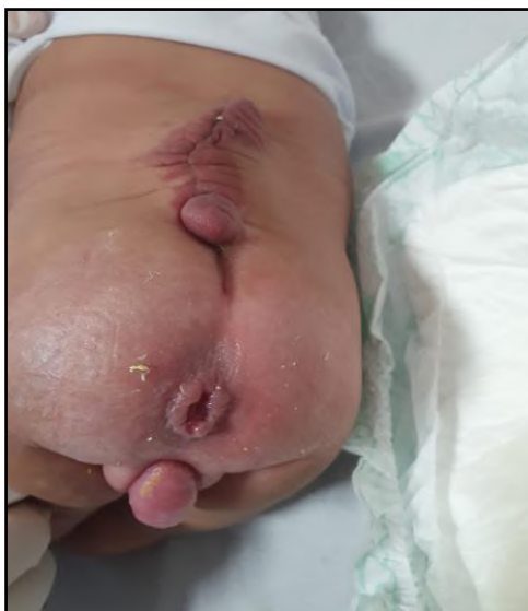
Figure 1 – Surgical scar for myelomeningocele correction.

After 1 day of life, she was sent to the capital for evaluation. Successful myelomeningocele surgery was performed, as shown in figure 1, which shows the surgical scar in the thoracic, lumbar, and sacral spine regions.