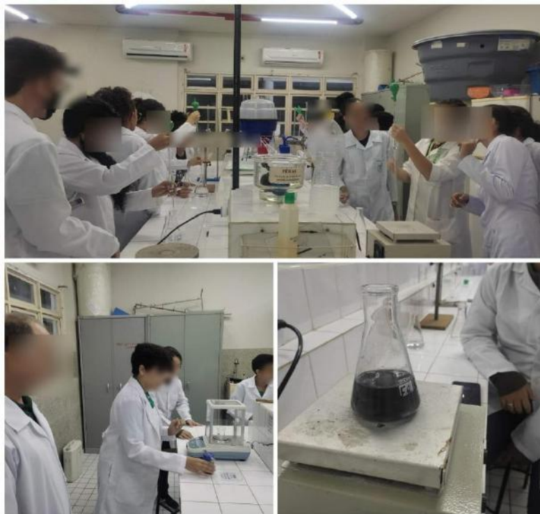
Figure 1 - Experimental batch adsorption procedure.