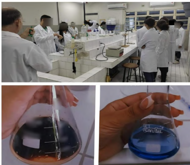
Figure 3 - Records of the experimental procedure to determine the Total Hardness.

In the informed stage, the participants of the activity analyzed the change of color from red wine to blue, and noted the volume spent. The same procedure was done with a blank test of equal volume of distilled water, to facilitate the observation of the turning. Figure 3 shows some of the records of the execution of the steps mentioned by the students.