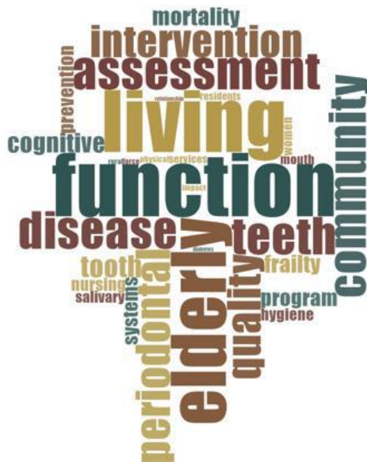
Figura 2 - Nuvem de palavras fornecida pelo software Rayyan, 2022.

A Figura 2 demonstra a nuvem de palavras produzida a partir dos principais resultados dos estudos contemplados nesta revisão, destacando-se os seguintes vocábulos: função, idosos, qualidade, intervenção; o que irá proporcionar uma sustentação às categorias elencadas a partir da análise, as quais permitem identificar a ênfase de cada estudo analisado.