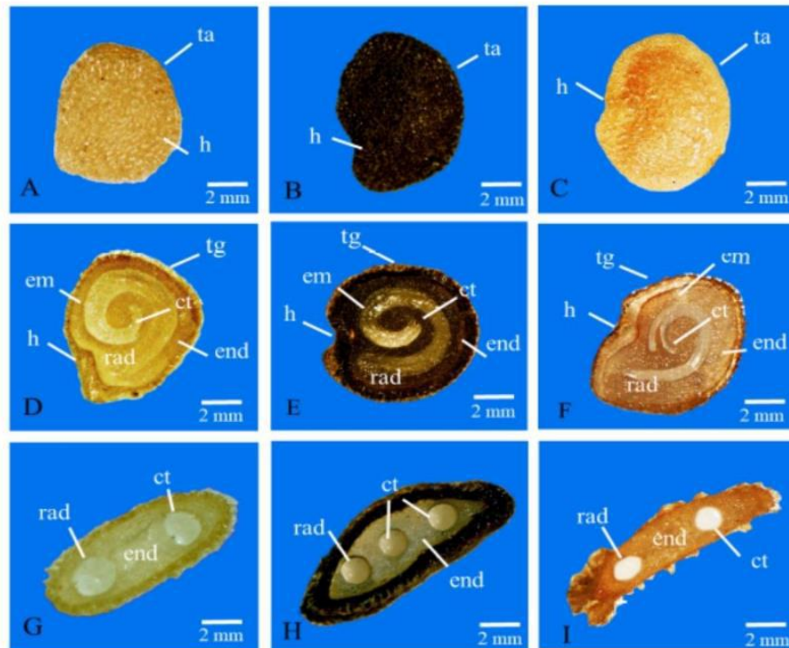
Figure 2 - (A, B and C) S. americanum , S. crinitum and S. stramonifolium ; (D, E and F) front view in cross-section, showing the position of the cotyledons and the hypocotyl axis; (G, H and I) longitudinal section showing the position of the embryo; ta-testa h-hilo, rad-radicle, ct-cotyledon, end-endosperm, in-embryo, tg-tegmen, rad-radicle.