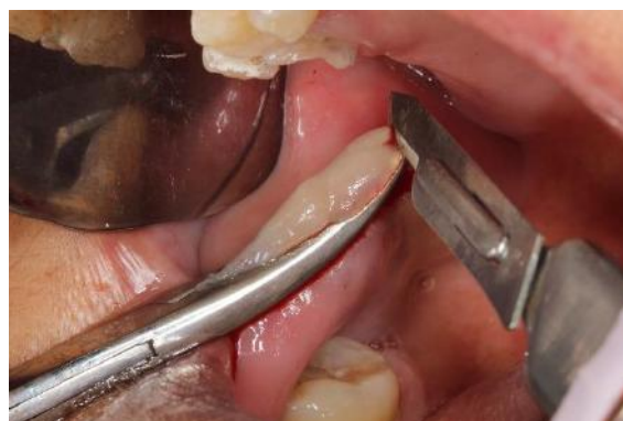
Figure 5 - Inferior peripheral incision.