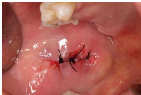
Figure 8 - Synthesis with simple points.