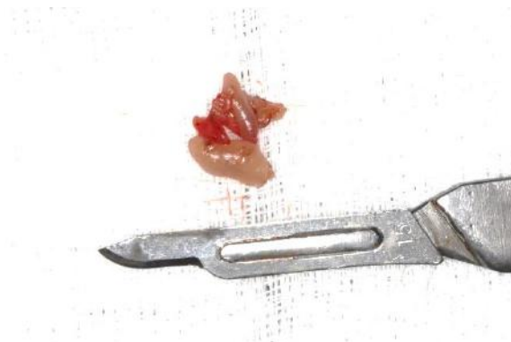
Figure 7 - Surgical parts.