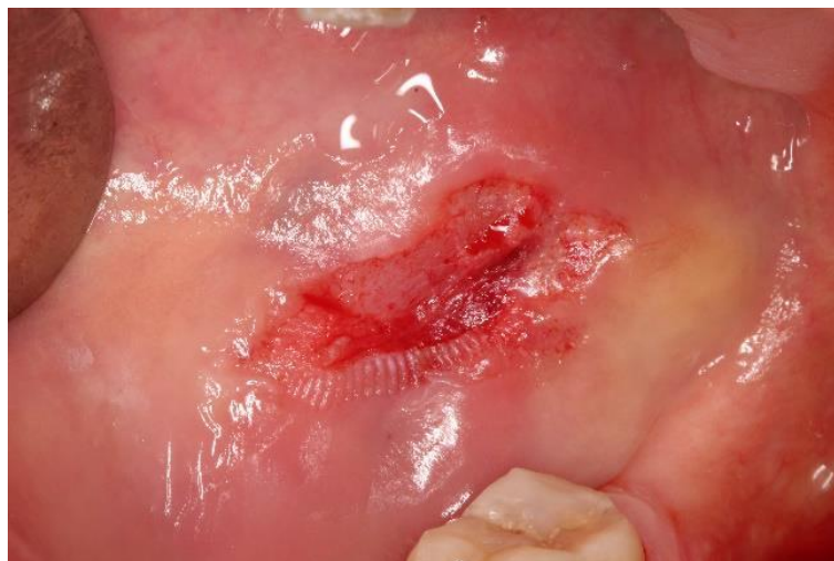
Figure 6 - Surgical area after removal of the lesion.