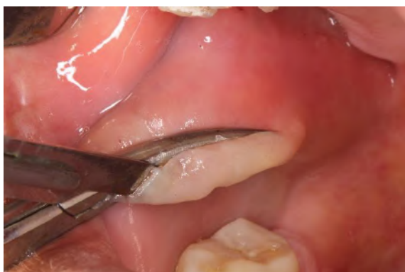
Figure 4 - Upper peripheral incision.