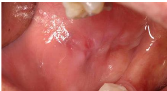
Figure 9 - Scar appearance after 10 days.