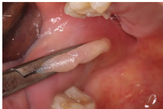
Figure 3 - Clamping at the base of the lesion.