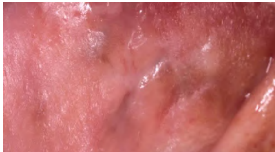
Figure 10 - Clinical appearance after 6 months.