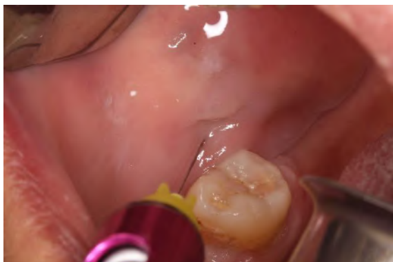
Figure 2 - Infiltrative anesthesia.