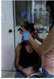
Figure 1 - EEG laboratory, placement of electrodes.