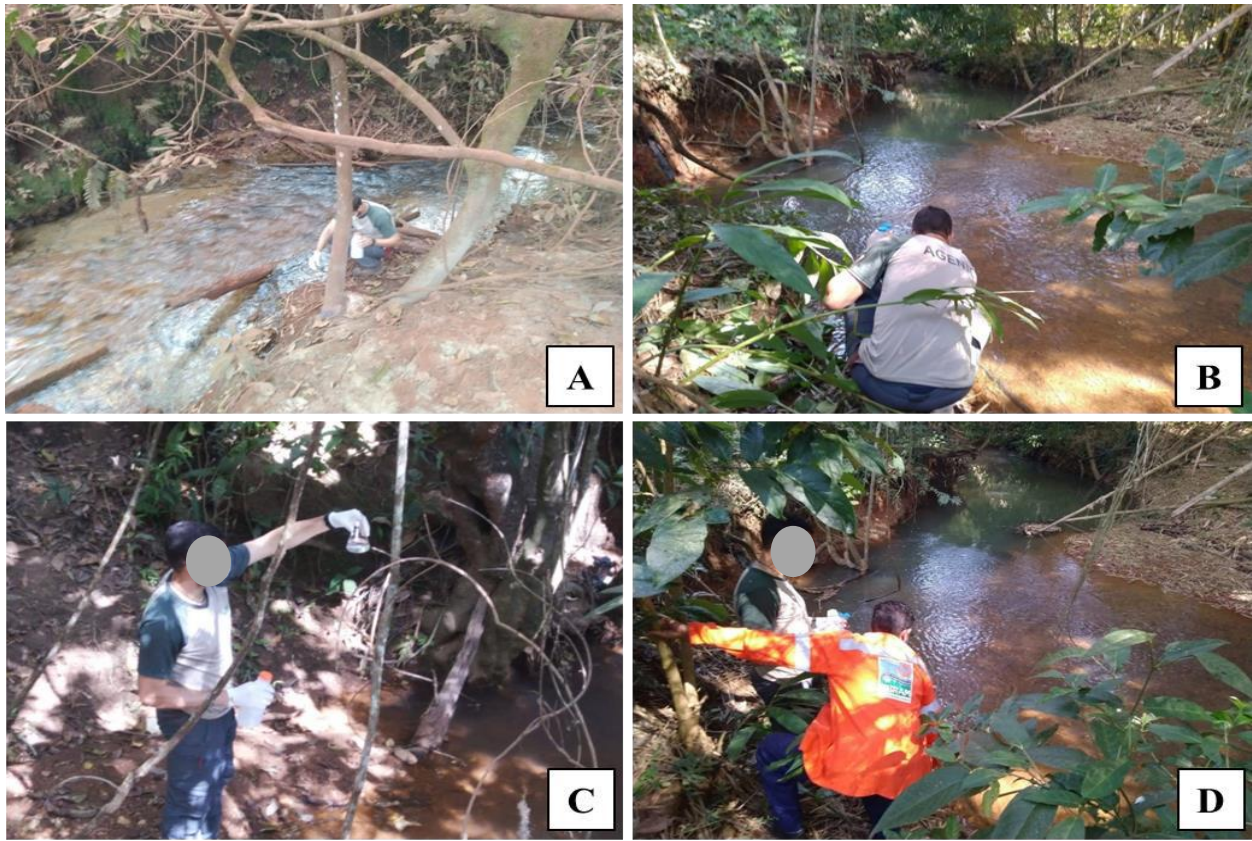
Figure 2 - Sample collection points. A: point 13, B: point 7. C: point 11 and D: point 7.