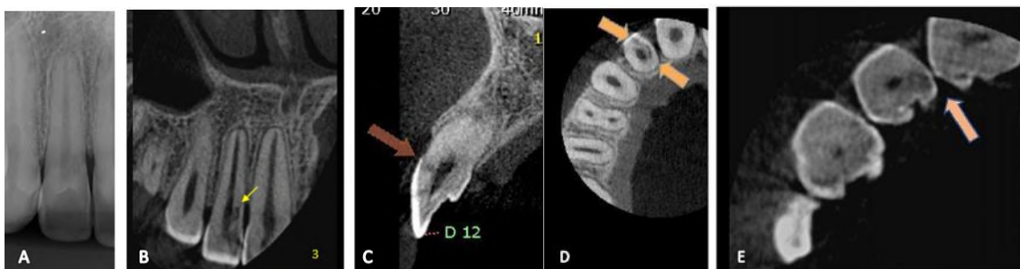
Figure 1 - In A, radiographic examination showing an irregular mottled radiolucency mesial to pulp space, and a breakdown of the crest of alveolar bone mesial of left maxillary lateral incisor. In B, C, D, and E, CBCT examination showing a hypodense area with radicular perforation in cervical third of left maxillary lateral incisor, and the breakdown of the crest of alveolar bone underlying the area of ECR (orange arrows).

Radiographic assessment showed an irregular mottled radiolucency mesial to the pulp space of tooth No. 22 with preservation of the pulpal limits, and a breakdown of the crest of alveolar bone mesial (Figure 1 A).