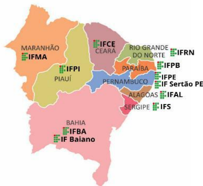
Figure 1 – Federal Institutes from Northeast Region.