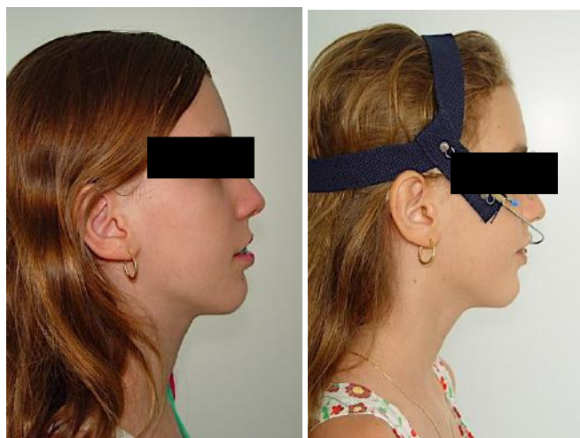
Figure 4 - Orthopedic treatment phase. In the first image, during the active phase, and in the second, in the contention phase.