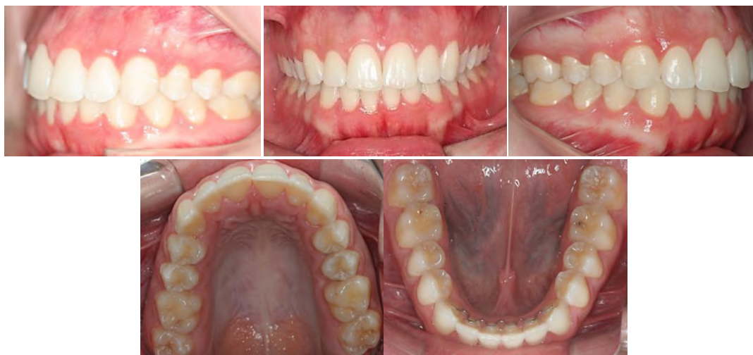
Figure 8 - Dental arches images after 4 years of treatment.