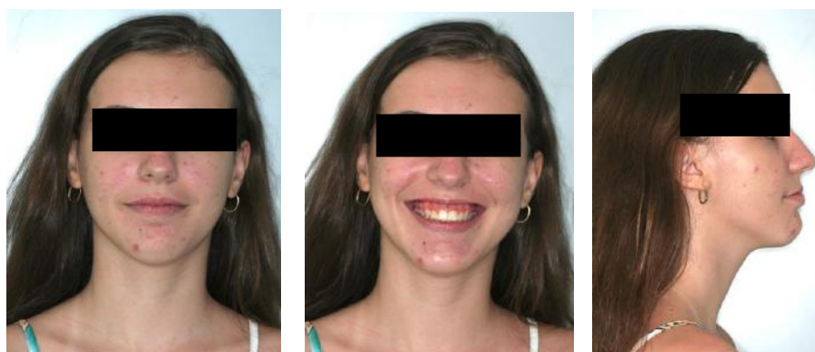
Figure 7 - Final face images at the end of treatment.