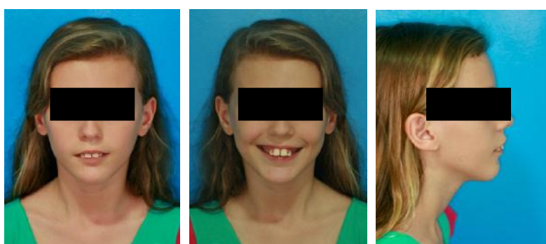
Figure 1 - Inicial face images at pre-treatment.

Female patient, 9 years old, complained about the sharp projection of the teeth. They informed that the child had used a pacifier until he was 5 years old. After a detailed anamnesis, it was observed that the patient had the habit of interposition of the lower lip, dolichofacial pattern, molars in Angle Class I and great projection of the upper incisors (Figures 1 and 2). Cephalometric evaluation revealed a marked anterior-superior buccal inclination ( 1.NA = 36.55^\circ and 1-NA = 10.17\text{mm} ), vertical growth tendency ( SN. GoMe = 42.12^\circ ) and ANB of 4.95^\circ . In the carpal radiograph, it was observed that the patient was in the pre-growth spurt phase, favoring the planning of the therapy in two phases (Figure 3).