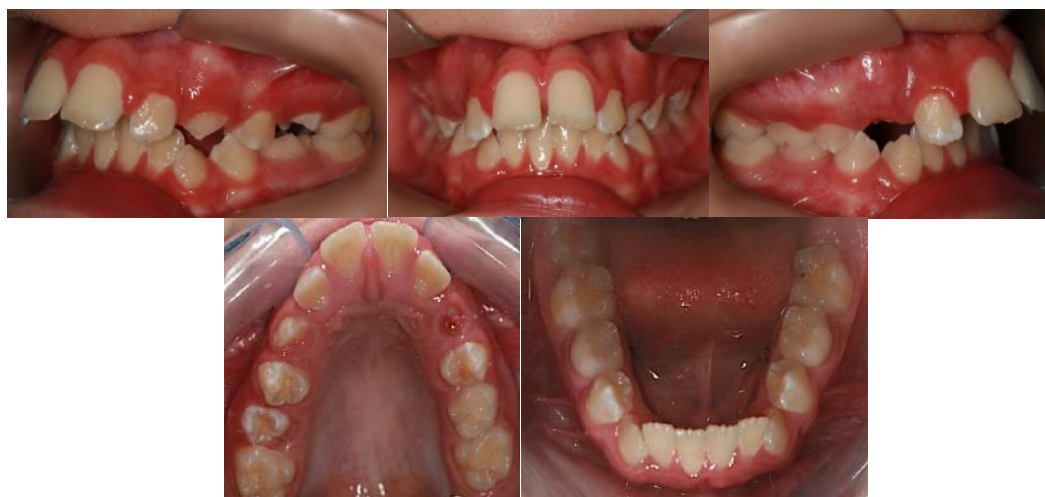
Figure 2 - Dental arches images at pre-treatment.