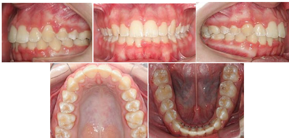
Figure 2 - Dental arches images at the end of treatment.