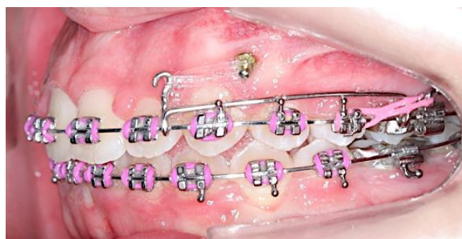
Figure 1 - Class II correction with mini-implant and sliding jig.

The orthodontic phase began during the orthopedic phase, when braces with prescription Roth slot 0.022 (Abzil-3M, São José do Rio Preto-SP, Brazil) were bonded. After the alignment and leveling, to correct Class II on the left side, an interradicular mini orthodontic implant (Morelli 1.5mm x 8mm, Sorocaba-SP) was installed between elements 23 and 24, with a sliding jig for distalization of element 26 (Figure 5). After correction and removal of the mini-implant, Class II 3/16" medium elastic (Morelli, Sorocaba-SP) was used for refinement. The orthodontic phase was completed after 24 months, without extraction of premolars, and showed a great result, with complete correction of the overjet. The retainer protocol was a wraparound removable appliance in the upper arch, and a lingual 3x3 fixed retainer in the lower arch (Figures 6 and 7).