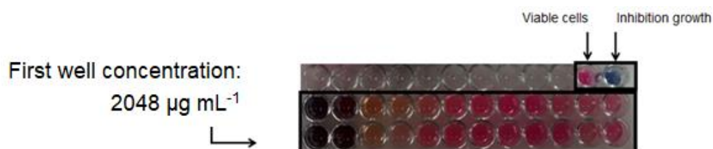
Figure 1. Demonstration of the experiment of antimicrobial activity of the CHCl 3 fraction of Piper montelagreanum branches against Staphylococcus aureus ATCC 25923

Legend - ATCC: American Type Culture Collection; MIC: Minimal inhibitory concentration; MBC: Minimal bactericidal concentration; CHCl 3 : Chloroformic fraction.