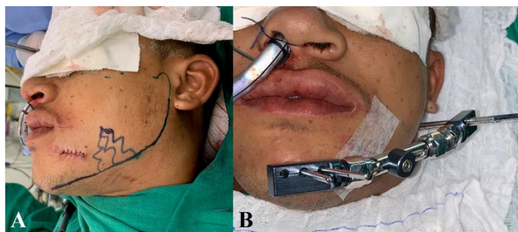
Figure 2. Trans-operative aspect and immediate follow-up of external fixator installation.

In the intraoperative time, a maxillary-mandibular blockade using steel wire was performed, surgical cleaning with copious irrigation with 0.9% saline and 2% chlorhexidine, removal of viable projectile fragments and suture of the entrance orifice. Closed fracture treatment and stabilization using the external fixation system were chosen by adapting an external wrist fixation – Colles fixator. Methylene blue was used for demarcating the fracture zone and the mandibular base; through small incisions and transcutaneous trocar. Figure 2 (A and B) demonstrate the four bicortical pins installed, two on each side of the fracture, united by the articulated nail of the fixator, adapting itself to the mandibular anatomy, where it was adjusted and fixed. Posteriorly, the maxillary-mandibular blockade was removed.