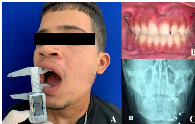
Figure 3. 6-month follow-up. Mouth opening, occlusion and radiograph outcomes.

In the immediate postoperative period, elastic bands were installed to stabilize and guide the occlusion, maintained for 60 days. Figure 3A shows the outpatient follow-up, with a satisfactory mouth opening, absence of pain, infection, and mobility. Antibiotic therapy and care guidelines for the transcutaneous pins, oral hygiene, diet and physical therapy were followed. As shown in the Figure 3 (B and C), the fixator was removed after two months under local anesthesia. In the six-month postoperative radiograph evaluation, a local bone callus formation was noted and functional occlusion was noted.