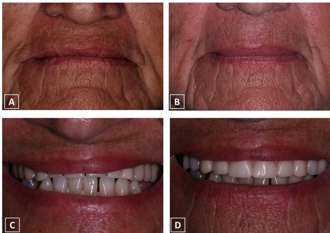
Figure 3. Second clinical visit: Patient with the previous prosthesis (A) and after the placement of the new prosthesis (B) with closed lip. Patient smiling with the previous (C) and new maxillary complete denture (D).

Placement of the new prosthesis (Figure 3 A-D) and adjustments.