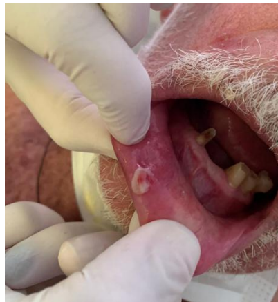
Figure 1 - Appearance of the lower lip lesion.

Male patient, 82 years old, brown, farmer and intern at the Cardiology ICU of the Hospital Metropolitano Dom José Maria Pires located in the city of Santa Rita-PB, was attended by the Dentistry team of the referred Hospital, during the routine visit. The patient presented as a pre-existing underlying disease coronary artery disease, systemic arterial hypertension and dyslipidemia, with previous history of myocardial revascularization surgery. In the clinical examination, carried out by the Dentistry team, a lesion on the lower lip on the right side was observed, with no history of symptoms, whitish in color, with raised edges, measuring approximately 2 centimeters in diameter, which at the touch detached from the lip mucosa, which one also had a sessile part (Figure 1).