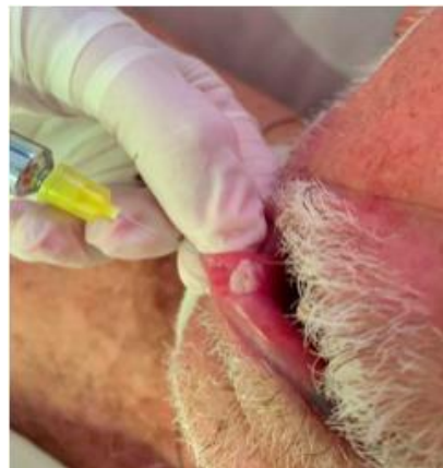
Figure 2 - Application of local anesthetic to perform biopsy.

tissue, cleaning and suturing with Nylon 4-0 thread was performed. After the surgery, the direct assistance team of the coronary ICU was instructed on how to maintain hygiene at the surgery site. The surgical specimen was conditioned in a container with 10% formaldehyde and sent for anatomopathological examination, whose diagnosis revealed ulcerated AC. The lesion presented an epidermis thickened by acanthosis on the slide, with cells showing nuclear pleomorphism and hyperchromism. The dermis presented vascular ectasia, diffuse lymphocytic infiltrate and basophilic degeneration of elastic fibers. Areas with foci of superficial erosion of the lining epithelium covered by a crust of necrotic and fibrinoleucocytic material were also observed.