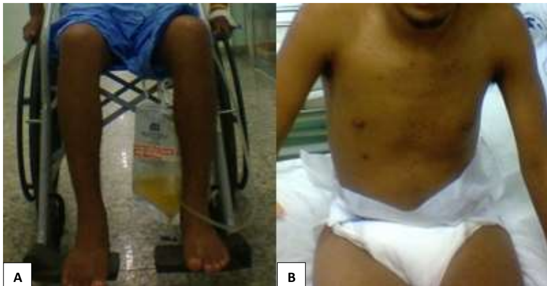
Figure 1 - Weakness in the lower limbs and urinary retention (A), and urinary incontinence (B).

We present the case of a 16-year-old adolescent who initially manifested a clinical picture of weakness in the lower limbs and urinary retention and, subsequently, urinary incontinence, during hospitalization (Figure 1). Acute flaccid paralysis, medullary schistosomiasis, and Guillain-Barré syndrome were initially suspected.