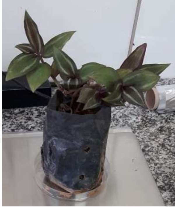
Figure 3. Aspect of plant species used ( Tradescantia zebrina ).

decoration due to its compact aspect (small size) and its leaves of purple and green colours. This plant has good adaptation to full sun and half shade and has a perennial life cycle (Patro, 2013).