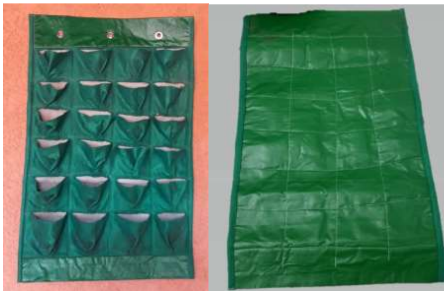
Figure 2. Panel made with cacharel (grey fabric at back) and felt (green fabric at the front), and back with green plastic canvas.