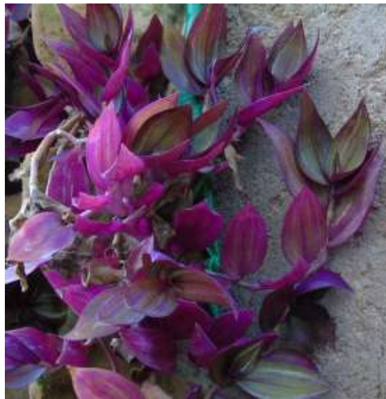
Figure 5. Aspect of Tradescantia zebrina , with adequate filling of the panel.

As for the visual aspect, a plant with the proper filling of the panel weighed 38.9 g (Figure 5).