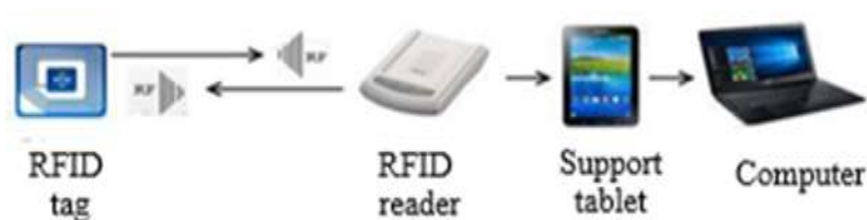
Figure 9 - RFID system components.