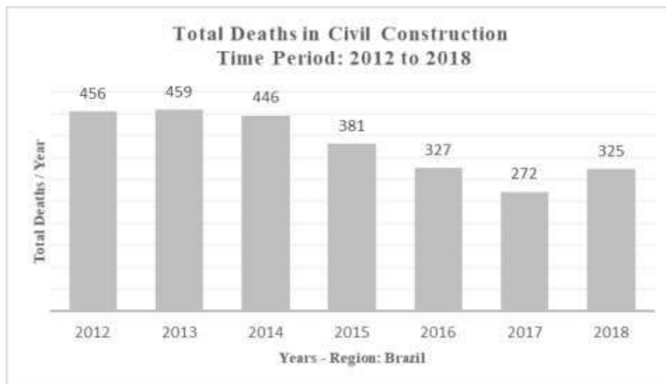
Figure 1 - Total deaths between the years 2012 to 2018 in civil construction.

In the period from 2012 to 2018 there was an average of 381 fatal accidents at work in civil construction, according to data from the Observatório Digital de Saúde e Segurança do Trabalho (SmartLab, 2020). Figure 1 below shows the numbers of deaths in civil construction, according to the Statistical Yearbook of Work Accidents - AEAT (AEAT, 2020).