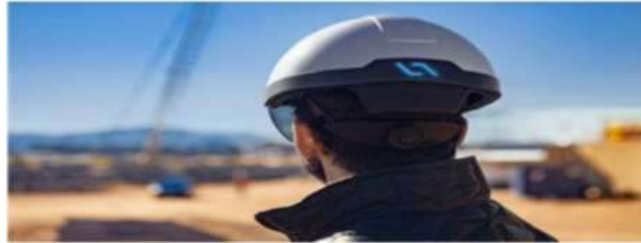
Figure 3 - Helmet with sensors.