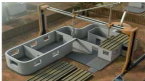
Figure 7 - 3D printing in construction.

3D Printing, also called additive manufacturing, consists of the deposition of layers of materials, for example mortar or concrete, which overlap each other and thus constitute the desired product (Volpato & Carvalho, 2017), shown in Figure 7. With its use, workers are removed from manual activities of greater danger existing on construction sites.