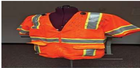
Figure 5 - Safety vest with sensors.