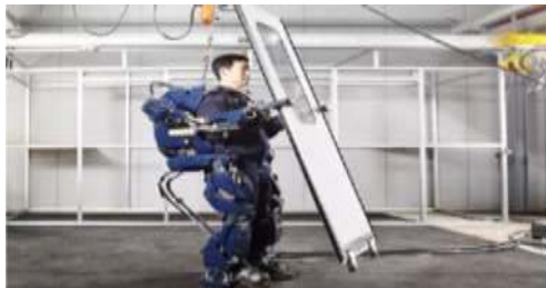
Figure 6 - Bionic exoskeleton.

Being able to lift heavy loads with less physical effort is the greatest achievement of the bionic exoskeleton suits. Through them, civil construction professionals reduce the risk of suffering injuries when carrying weight (Fiep, 2020). Figure 6 shows an example of the exoskeleton application in a civil construction work.