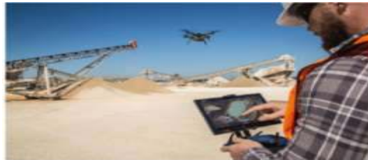
Figure 8 - Drones in construction.