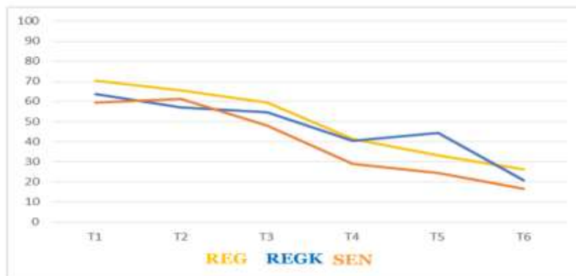
Figure 2 - Professional evaluation in SEN, REG and REGK groups. REG group presented a DH mean of 2.5 at T1 and 0.7 at T6. REGK presented a DH mean of 2.2 at T1 and 0.5 at T6. SEN presented a DH mean of 2.1 at T1 and 0.5 at T6.

The professional evaluation showed a significant reduction in DH with the use of all three technologies (2.26 to 0.56) after T4 ( p < 0.05 ) (Figure 2). All patients initially presented moderate to severe pain (64.3) and after treatments reported mild pain (21.3).