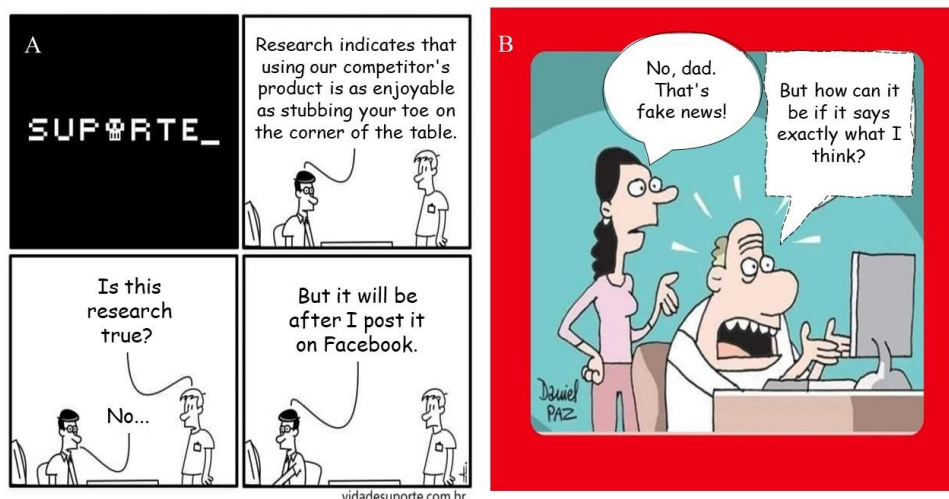
Figure 1 - Examples of comic strips that criticize fake news and which were presented to students as a way of raising awareness on the topic.