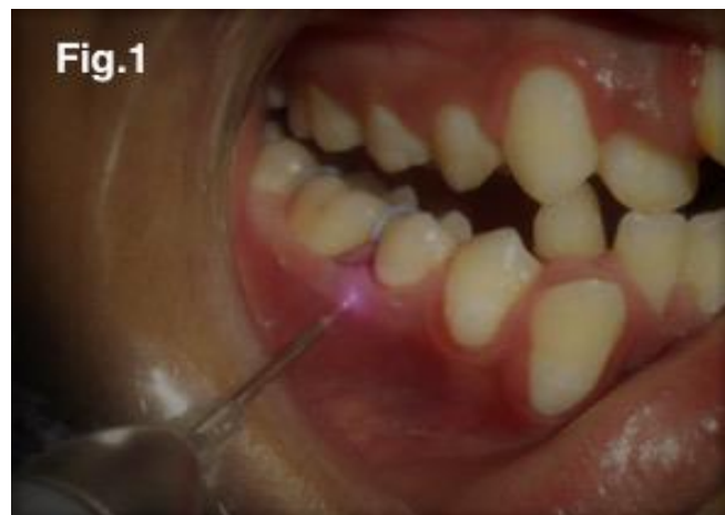
Figure 1: Application of infrared laser.

The tip of the device was positioned perpendicularly to the mucosa (without pressing) for the application in the active group and simulated laser in the placebo group (Figure 1). The parameters in the active PBM group were of 2 J of energy applied in 20 seconds per point, adding up to 12 J per molar (6 J on the vestibular surface and 6 J on the lingual surface). The parameters, described in Table 1, were selected based on a previous study (Sousa, 2014). An hour after the positioning of the orthodontic separators and application of PBM (active or placebo), the patients reported their perceptions of pain on a numeric visual analog scale (VAS) (Figure 2) at predetermined intervals. The 11-point scale ranges from 0 (absence of pain) to 10 (intolerable pain). Participants were instructed not to take any medications during the trial.